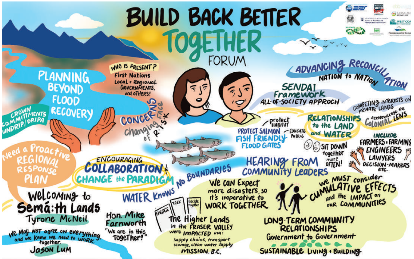
Build Back Better Together Forum, July 14, 2022